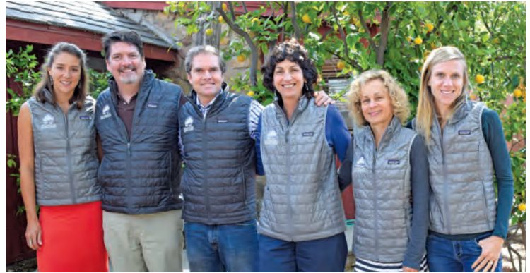
Give us 10 minutes of your time and get a chance to win a Patagonia Nano Puff Vest.

Visit EnvironmentalDefenseCenter.org today to take the survey.