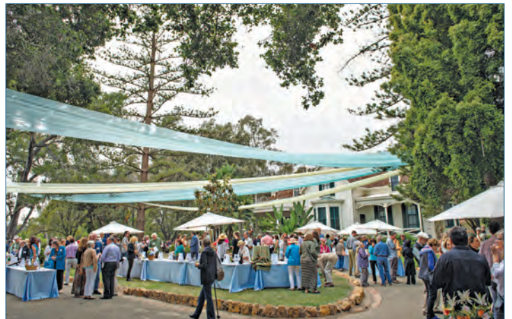
Nearly 500 guests joined us in the gardens at Rancho La Patera & Stow House