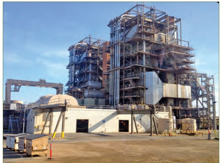
NRG's Mandalay Bay Power Plant is one of three on the beaches of Oxnard – we do not need a fourth!

The burden of three dirty, fossil fuel power plants currently threatens the community of Oxnard and its beaches. EDC is working alongside our clients and partners to prevent the addition of a fourth: NRG's proposed Puente Power Project. Not only would NRG's new plant be built on environmentally sensitive habitat, including the Santa Clara River mouth and wetlands, but reports show the site is at risk of sea-level rise, beach erosion, and tsunamis. We reached an important milestone when the Coastal Commission recommended that the CA Energy Commission (CEC) relocate the project, however ultimately final decision is up to the CEC. With a final decision set for spring 2017, EDC will continue working to protect Oxnard's coastal resources, and advocating for alternative energy solutions to these dirty fossil fuel projects.