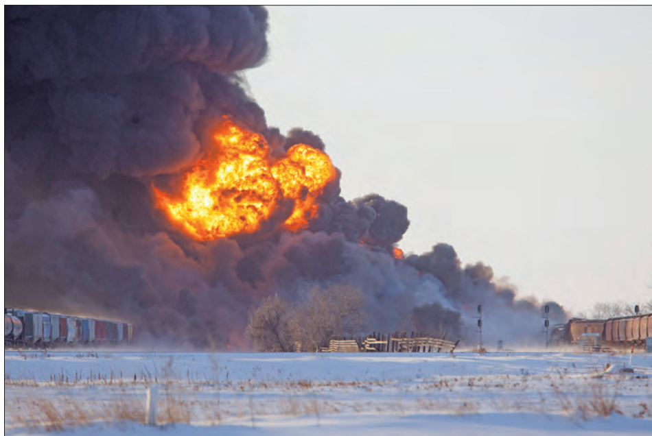
Phillips 66 proposal increases risks of oil spills and explosions and threatens our communities safety.

Friends of EDC have been both generous and active in this effort. Your support has made an enormous difference and we look forward to working with you in 2017 to finally defeat oil trains in our region.