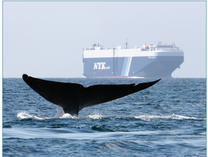
Every year thousands of large container ships transit the Santa Barbara Channel, overlapping with a critical feeding zone for great whales.

Since 2007, after five endangered blue whales were killed in the Santa Barbara Channel because of ship strikes, the Environmental Defense Center has been working to protect the many species of great whales that pass through or live off our coast, including the largest seasonal population of blue whales in the world. We are now working side-by-side with the Santa Barbara County Air Pollution Control District and the Channel Islands National Marine Sanctuary to encourage ships to slow down in the Channel. By collaborating with agencies, shipping companies, the Navy, the Coast Guard and other concerned individuals and organizations, we look to both protect whales and reduce dangerous air pollution from shipping – the greatest producer of Nitrogen Oxide (NOx) in the County - that has been impacting residents for years.