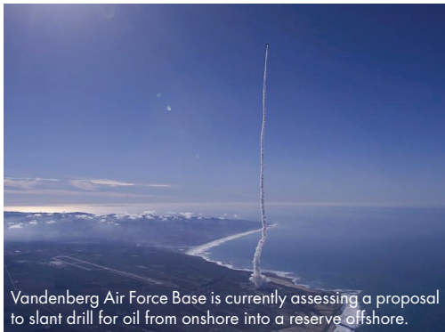
Vandenberg Air Force Base is currently assessing a proposal to slant drill for oil from onshore into a reserve offshore.

In November 2013 EDC formally expressed our concern to the Air Force on behalf of several environmental organizations, objecting to a proposal by a private company, Sunset Exploration, to slant drill for oil from a location on Vandenberg Air Force Base (VAFB) into offshore reserves. This proposal would require development of new oil drilling and production facilities, and would threaten the magnificent coast near Point Arguello, offshore state Marine Protected Areas, and the Santa Ynez River with a potential oil spill. As the Base conducts an internal assessment of the proposal, EDC continues to urge them to refrain from opening the Base to private oil drilling and to ensure protection of the unique and sensitive environmental resources, and to avoid potential negative impacts to our clean air, clean water and public health.