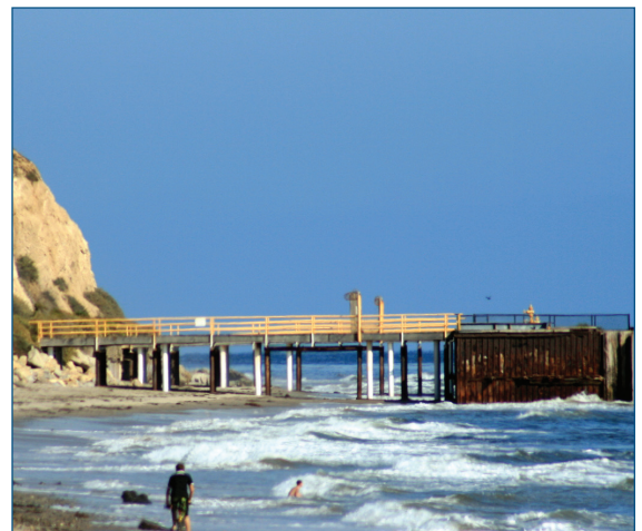
Venoco is proposing to resume oil production on the Ellwood Pier (pictured here), which was shut down after an oil spill occurred in 1994. Venoco proposes to process the oil and gas at the aging Ellwood Onshore Facility located between Bacara Resort Hotel and Sandpiper Golf Course.

For years, the Environmental Defense Center and our clients have worked to prevent Venoco from expanding oil development offshore Ellwood, near UCSB and Ellwood Mesa. Just two years after celebrating the departure of the last oil barge to ever leave the Ellwood Marine Terminal, EDC celebrated another success as the State Lands Commission (SLC) voted to require additional analysis of Venoco's request to resume drilling on the Ellwood Pier. Due to the facility's aging infrastructure and the risk of oil spill, EDC and our clients oppose this project and urged the SLC to require Venoco to analyze processing the oil and gas at Las Flores Canyon, the one designated processing site on the south coast. Up until this hearing, the only two options considered for processing this oil were the unsightly Ellwood Onshore Facility, located between Sandpiper Golf Course and the Bacara Resort Hotel, or on the Ellwood Pier itself, both of which are unacceptable to EDC and our clients who want to protect the environment and this public recreation area. The SLC also responded to EDC's request to ensure specific measures for mitigation of greenhouse gas emissions.