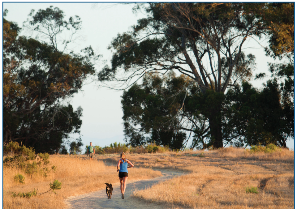
More Mesa is one of the largest and most pristine coastal open spaces currently threatened with development in Santa Barbara County.

Thank you for your continued, generous support for our work.