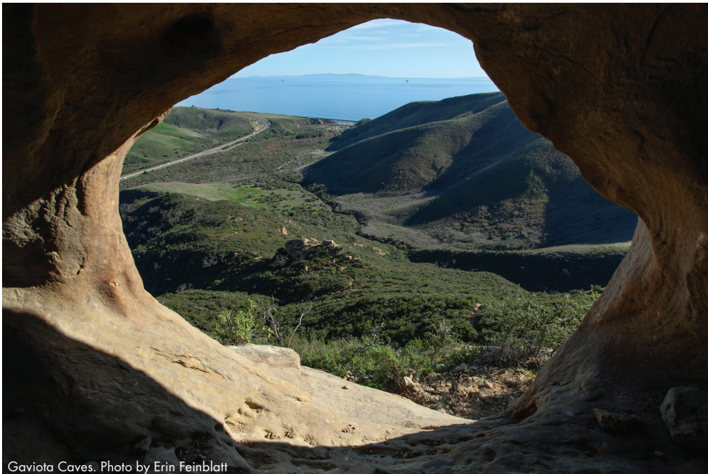
Gaviota Caves.