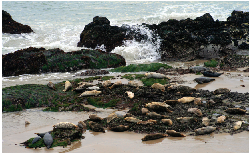
Venoco hopes to slant drill from a 175-foot-tall rig near the Carpinteria Bluffs and the harbor seal sanctuary.

Three years ago, 70% of Carpinteria voters said 'NO' to Measure J, Venoco's Paredon Oil & Gas Project to slant drill from a 175-foot-tall rig next to City Hall, the harbor seal haul-out and sanctuary, Carpinteria Bluffs and the Arbol Verde neighborhood. Well, there's bad news: they're back! Luckily, EDC and our clients haven't gone anywhere, and we remain vigilant to ensure this proposed Statue of Liberty-sized rig and associated oil development will not threaten Carpinteria's people and environment.