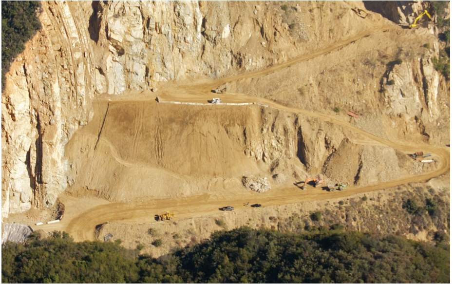
The Ojai Quarry, located near Highway 33 on North Fork Matilija Creek, discharges chronic amounts of sediment and frequent rockslides into the creek during storm events, polluting our water quality and wildlife habitat.

EDC and our clients continue to be very concerned about the failure of the Mosler Rock Ojai Quarry's owners to clean up their act – or at least their site. Runoff from this Ventura County rock mine is seriously polluted, far in excess of the federal standards, and causing real danger to clean water and wildlife, including endangered steelhead trout. EDC and SB ChannelKeeper attempted to work with the quarry's owners for many months but finally, as a last resort, have had to file a law suit for the quarry's violations of the Clean Water Act and the Endangered Species Act.